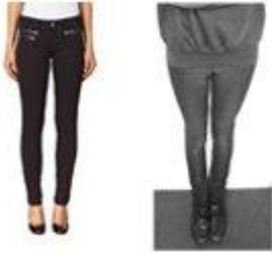
Unacceptable girls' trousers